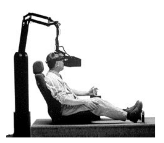
Figure 5: BOOM 3F

Haptic devices provide output from the computer to the user by simulating force and tactile feedback. Users can 'feel' force, tension, friction, pressure, temperature, and speed of