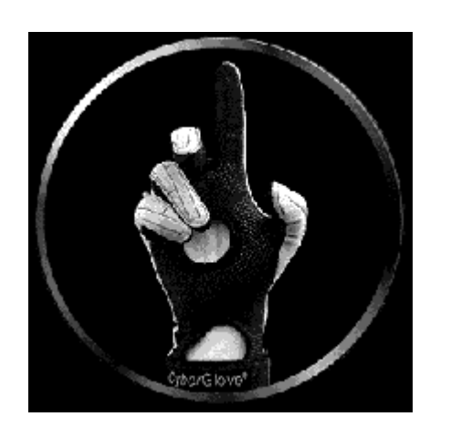
Figure 2: CyberGlove

Data gloves. These indicate the position of the fingers and hand, interact with the virtual environment, and signal commands to the computer through gestures (see Figure 2). Gloves typically have thin fiber optic sensors sewn into the cloth that bend and stretch when the fingers move (Biocca and Delaney 1995), and communicate finger movement to the computer. A position tracker, usually attached to the back of the wrist, monitors the position and orientation of the hand and can be used to create a 3D representation of the user's hand in the virtual environment. When the glove collides with an object, the computer can be signaled to lift it and move it. Gloves can also be designed to provide force and tactile feedback (discussed later). Finally, bodysuits or exoskeletons are available, which function similarly to the glove, but they track movement of the entire body and display a virtual body to which the users can relate.