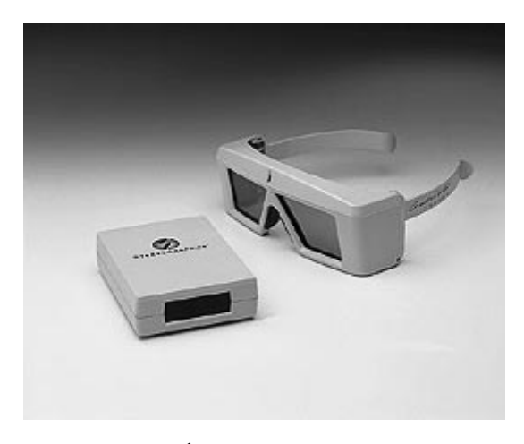
Figure 3: CrystalEyes

Output devices. Output devices convey information from the computer to the user about the virtual environment. There are three groups of output devices: visual displays, haptic devices that convey force and tactile information to the user's body, and audio devices.