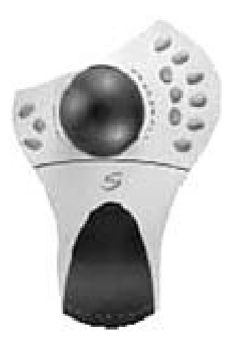
Figure 1: Spaceball 4000 FLX

Data gloves. These indicate the position of the fingers and hand, interact with the virtual environment, and signal commands to the computer through gestures (see Figure 2). Gloves typically have thin fiber optic sensors sewn into the cloth that bend and stretch when the fingers move (Biocca and Delaney 1995), and communicate finger movement to the computer. A position tracker, usually attached to the back of the wrist, monitors the position and orientation of the hand and can be used to create a 3D representation of the user's hand in the virtual environment. When the glove collides with an object, the computer can be signaled to lift it and move it. Gloves can also be designed to provide force and tactile feedback (discussed later). Finally, bodysuits or exoskeletons are available, which function similarly to the glove, but they track movement of the entire body and display a virtual body to which the users can relate.