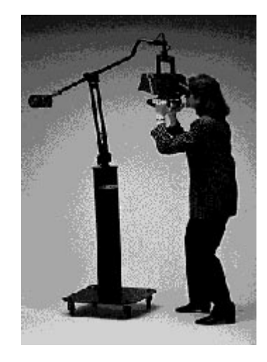
Figure 6: Boom 3C