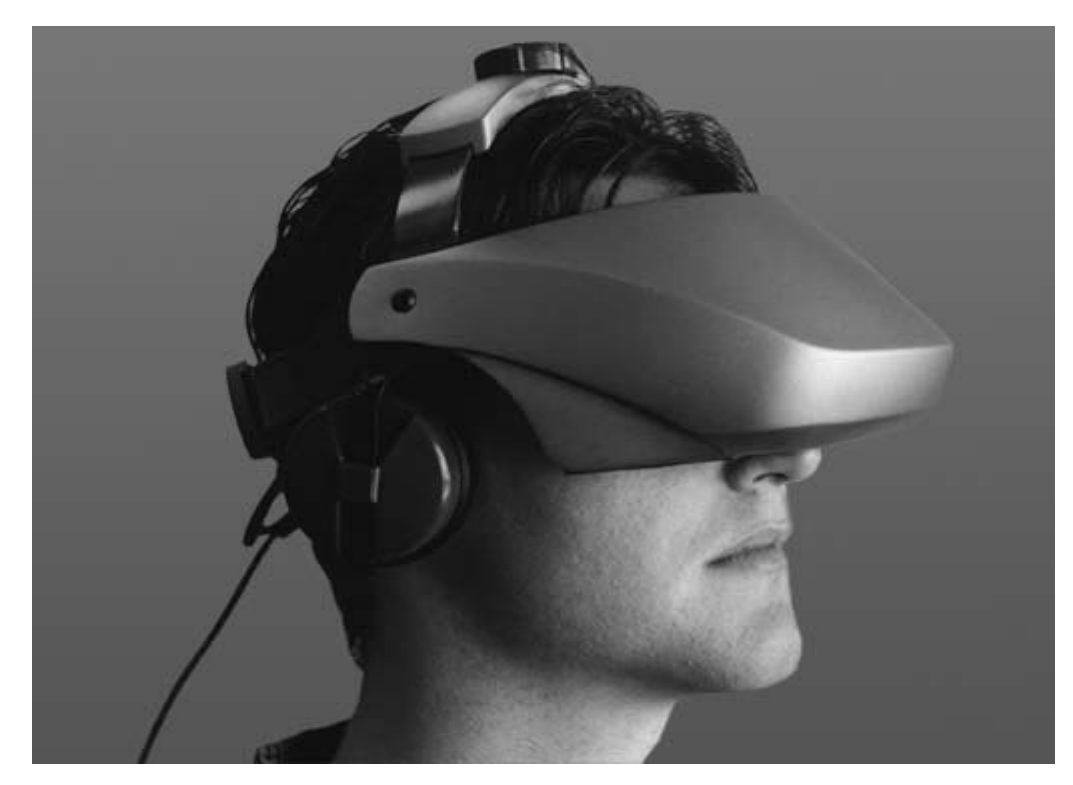
Figure 4: HMD 800-35

BOOM systems have become a popular alternative to HMD because users do not support the image display on their heads. Rather, the BOOM involves a viewer mounted on a stand, which the user holds to his or her face to view the virtual environment. The user can sit or stand, and moves the viewer using handles to observe different aspects of the virtual environment (see Figure 5 and Figure 6). In addition, the user can easily shift between the virtual and real environment because no equipment must be put on and taken off, as with HMD. Although motion may be slightly restricted due to the design of the BOOM, the quality of the graphics display is higher than HMD.