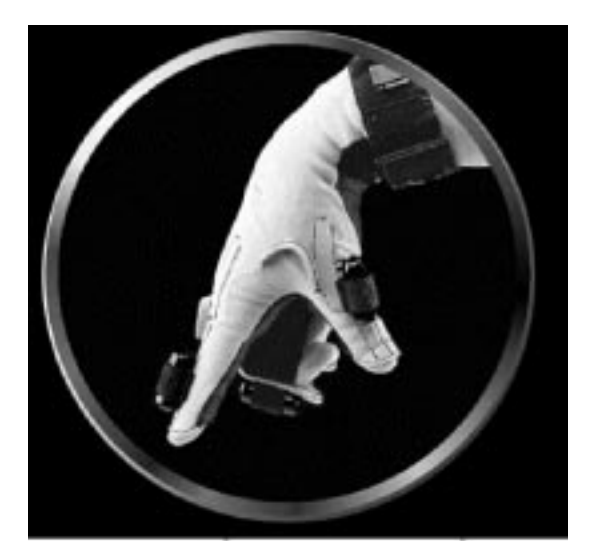
Figure 8: CyberTouch

objects. Force feedback devices convey information about the resistance of surfaces (e.g., prevents users from walking through walls) and the gravity, weight, and solidity of objects. This feedback is provided through mechanisms such as joysticks, steering wheels, and handgrips. As mentioned earlier, gloves and exoskeletons or bodysuits can be designed to convey force feedback (see Figure 7).